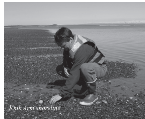
Knik Arm shoreline

As this newsletter went to press, the Transportation Equity Act: A Legacy for Users (TEA-LU) bill was in joint Senate-House conference committee. From there, TEA-LU must be passed by a majority vote in the House and Senate. If it passes, the bill must be signed by the President. Should President Bush veto the bill, TEA-LU can still be passed by another two-thirds vote in both the House and Senate. TEA-LU will provide transportation funding nationwide for six years, including a portion of the funding to construct a Knik Arm Crossing.