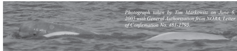
Photograph taken by Tim Markowitz on June 6, 2005 with General Authorization from NOAA, Letter of Confirmation No. 481-1795.

Last June, a group of about 100 belugas appeared in Knik Arm, staying in the area through November. Since they left in November, only a few individual whales have been spotted briefly, suggesting that the majority of the whales were residing elsewhere. Now watchers are observing some belugas at the mouth of the Susitna River and in Knik Arm. Scientists expect the whales to return in numbers similar to last June. Preliminary results from the year-long study will be available in July, and the complete study will be included in the draft EIS.