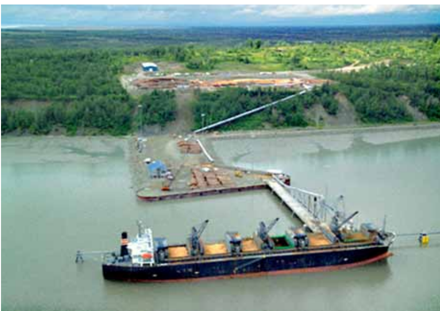
The Knik Arm Crossing would connect the busy Port of Anchorage with Port MacKenzie, the only Southcentral port site not constrained by urbanization. Port MacKenzie's 14 square miles of uplands are dedicated solely for commercial/industrial development. In addition to the bridge, a railroad spur is planned for Port MacKenzie.